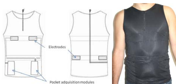
Figure 3: View of different parts of developed T-shirt to biopotentials registers.